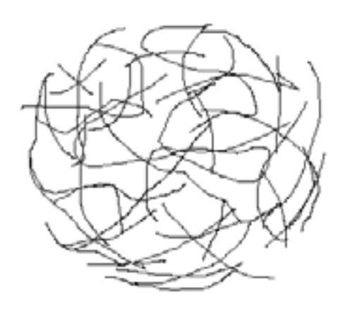
Figure 3. Chaos Model

The third figure in challenging prevalent conceptions of cultural linearity encompasses much that is inherent to model five of Chalmers. It demonstrates that in post-modern conceptions of the world knowledges are contingent: nothing is freestanding or informed by its own notional unique past and cultural imperatives.