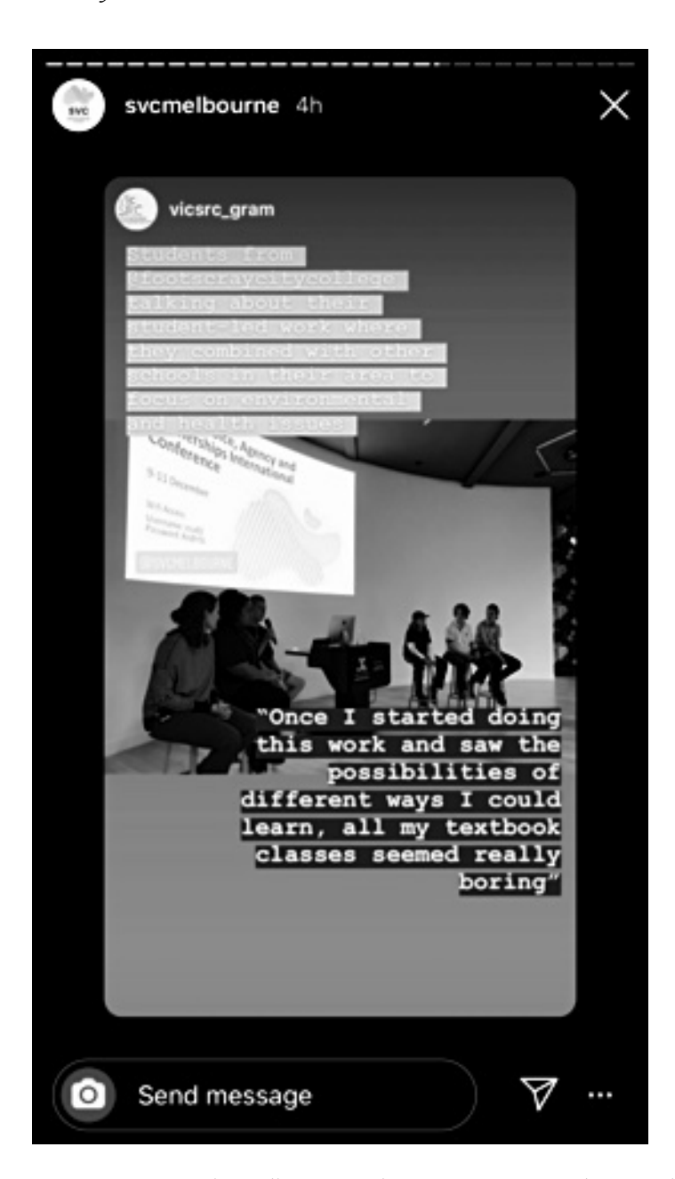
Figure 1. Tweets at the Melbourne Student Voice, Agency and Partnerships International Conference, December 2019 (first published in Connect and used with permission).