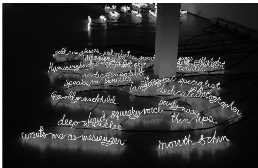
Figure 5: Jill Magid, Detail of Miranda III , Yvon Lambert Paris, 2009.

Another example of this animating imperative can be seen in the fact that Magid was commissioned to make art, and yet large portions of that art - the novel Becoming Tarden - had to be redacted. In deciding to exhibit the book complete with its absences, Magid forces the viewer to face the aesthetics of concealment. Redaction as the subject of art has precursors, of course,