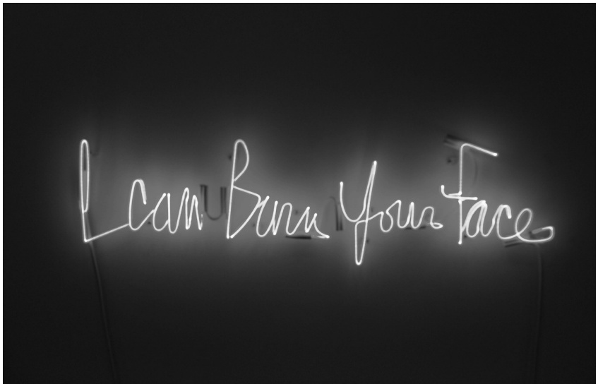
Figure 4: Jill Magid, 'I Can Burn Your Face', wall-mounted title piece, 7mm Neon, transformers and wires, Article 12', Stroom, The Hague, 2008. Courtesy of the artist.

35. See Magid's description of this work on her website: www.jillmagid.net/Article12.php .