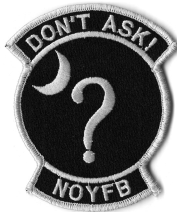
Figure 2: Trevor Paglen, 'NOYFB', Fabric Patch, 2006.