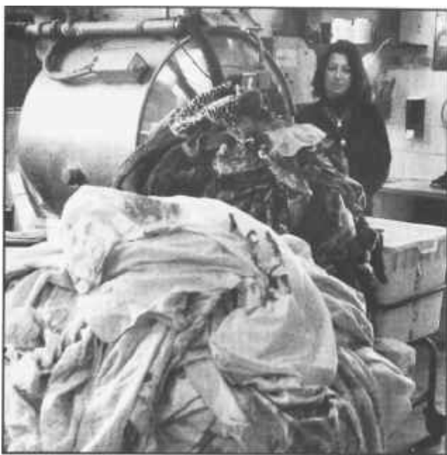
On Kibbutz Megiddo jobs include laundry and jewellery manufacture.